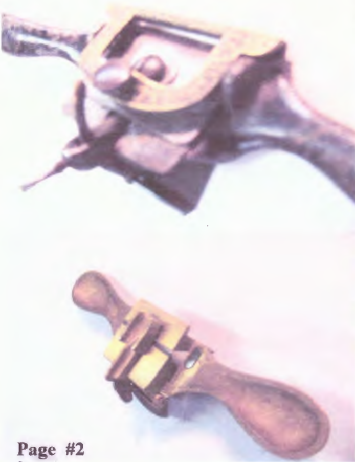
Left: Shave with flexible sole as a compass plane. Lower: Bronze rabbet shave with fence, cuts left and right. Below: Collection of 73 spoke shaves