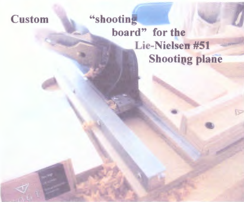
Custom "shooting board" for the Lie-Nielsen #51 Shooting plane

A lot of demos, networking, tool talk and visiting. Later on the second day is the lobster bake.