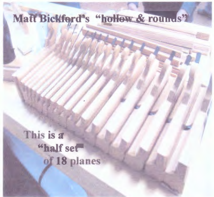
Matt Bickford's "hollow & rounds"