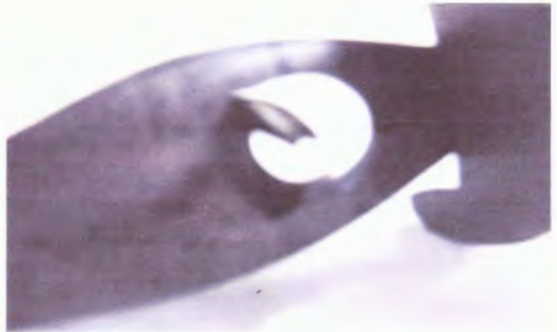
Right: Although the close-up is blurry, the 2 points on the upper cutter shows the lead cutting edge that makes possible to grove cross-grain on wood.

Pictured are the four spoke shaves in the same order as on the cover. Left 3 are bronze and all without maker's names. The bronze shaves may be used as router planes; however, the 2 center shaves have a fence and may perform edging or groves parallel to the edge. The iron shave makes groves and having two cutters, with the lead cutter scoring the edge, making it possible to grove cross-grain.