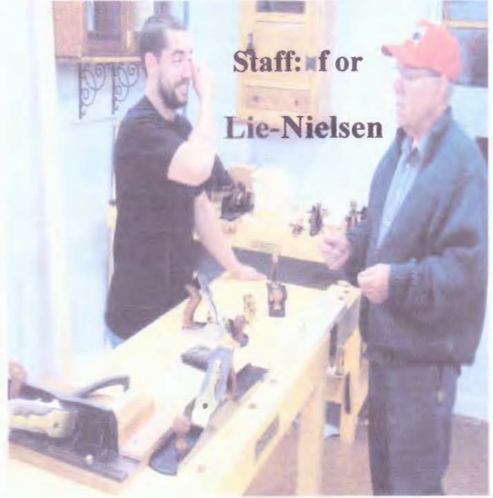
Staff: f or Lie-Nielsen