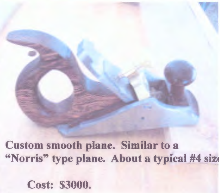
Custom smooth plane. Similar to a "Norris" type plane. About a typical #4 size