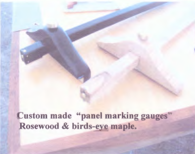
Custom made "panel marking gauges" Rosewood & birds-eye maple.